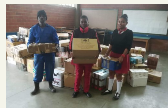
Books arriving in Kwadukuza