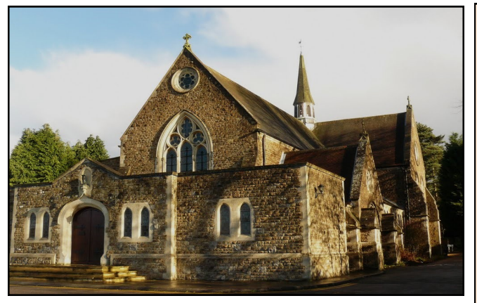
ESSENDENE ROAD, CATERHAM, CR3 5PA