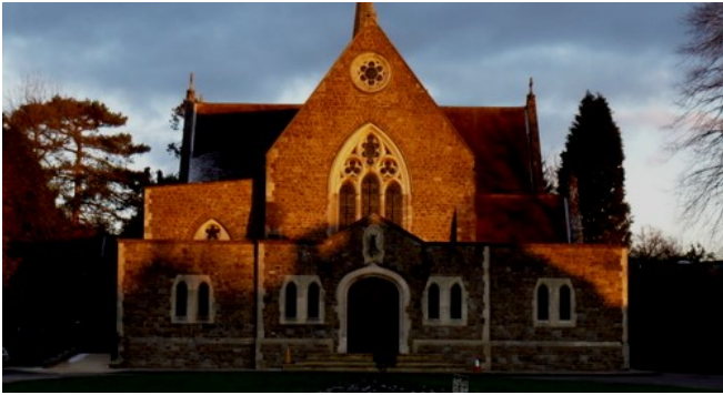
The Arundel & Brighton Diocesan Trust is a Registered Charity No 252878