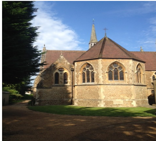
View from the back of our church