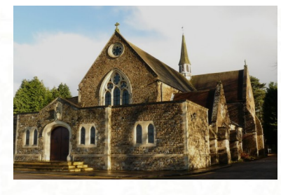
Parish Christmas Market - Sunday 26th November

SVP Support - The Parish SVP Conference can be contacted for support at any time on 07599890043