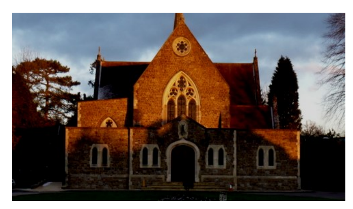
The Arundel & Brighton Diocesan Trust is a Registered Charity No 252878

Noviembre 2013 Lires | Maries | Mercels | James | Verman | Salacio | Domingo | 1 | 2 | 3