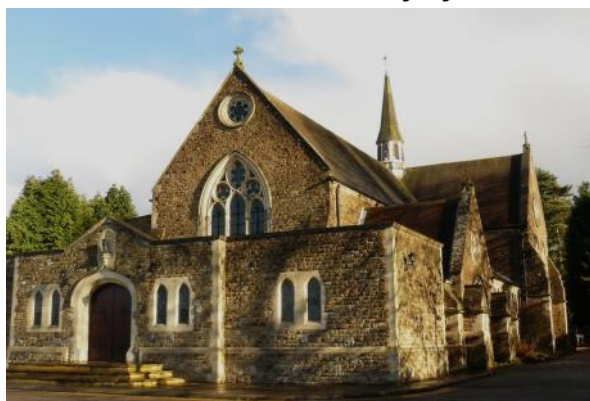
The Arundel & Brighton Diocesan Trust is a Registered Charity No 252878 with Fair Trade Status