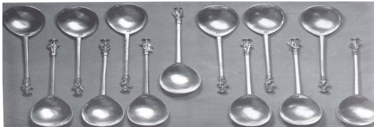
Full set of Apostle Spoons.