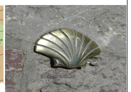
The Scallop Shell, emblem of St James, worn by pilgrims