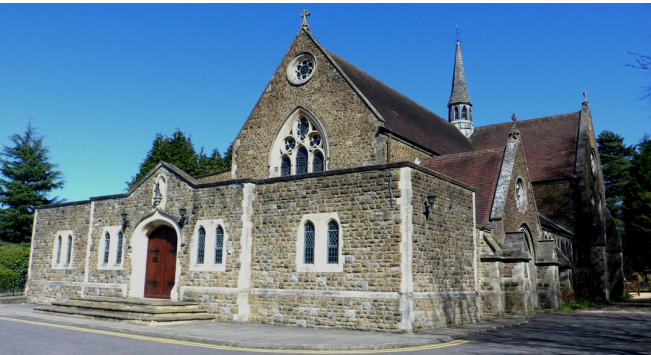
The Arundel & Brighton Diocesan Trust is a Registered Charity No 252878