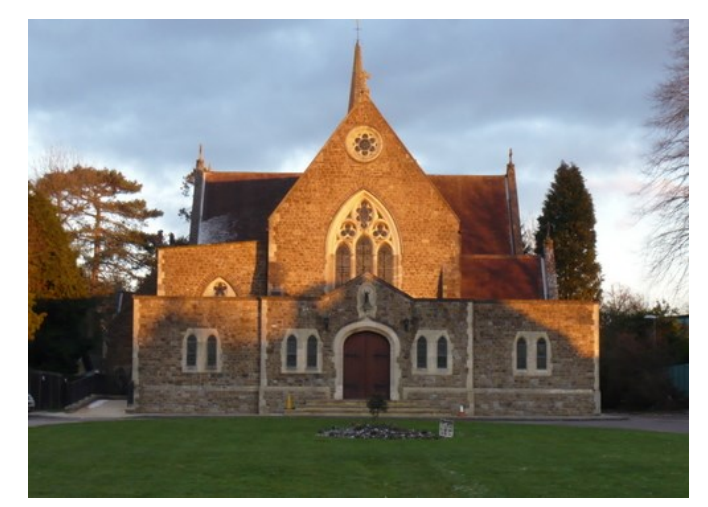
The Arundel & Brighton Diocesan Trust is a Registered Charity No 252878