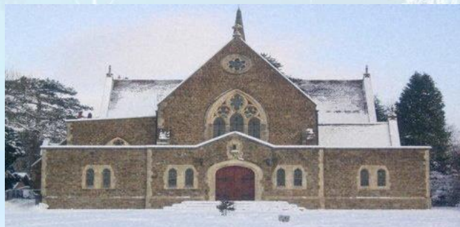
The Arundel & Brighton Diocesan Trust is a Registered Charity No 252878 with Fair Trade Status