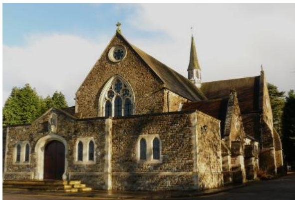
The Arundel & Brighton Diocesan Trust is a Registered Charity No 252878 with Fair Trade Status