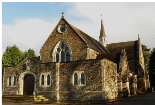
The Arundel & Brighton Diocesan Trust is a Registered Charity No 252878 with Fair Trade Status