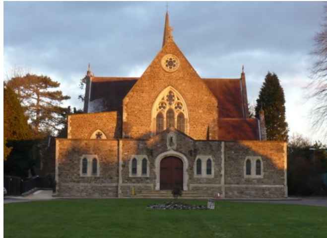
The Arundel & Brighton Diocesan Trust is a Registered Charity No 252878