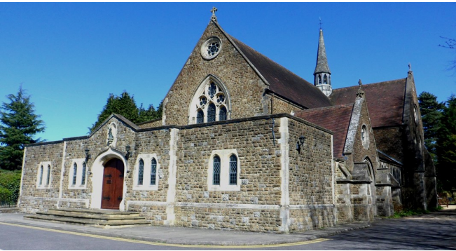
The Arundel & Brighton Diocesan Trust is a Registered Charity No 252878

Tel: 01883 343241 priest@sacred-heart.co.uk