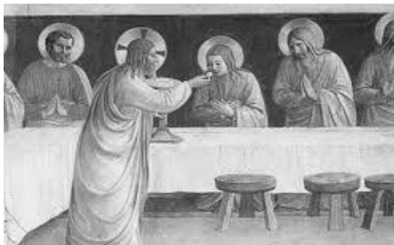
Detail from 'Institution of the Eucharist' (1441) by Fra Angelico