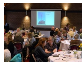
Madaba Lunch 2016

At the lunch and after Mass on Sunday 19 th November there will be an opportunity to sign Christmas cards for refugees and parishioners in Madaba.