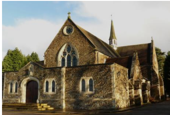
The Arundel & Brighton Diocesan Trust is a Registered Charity No 252878 with Fair Trade Status