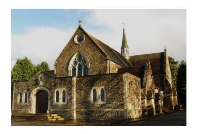
The Arundel & Brighton Diocesan Trust is a Registered Charity No 252878 with Fair Trade Status