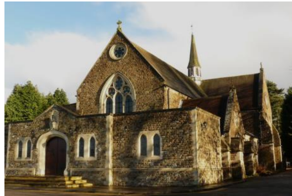
The Arundel & Brighton Diocesan Trust is a Registered Charity No 252878 with Fair Trade Status