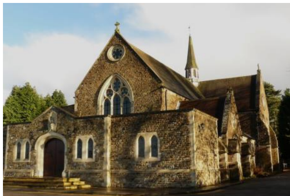
The Arundel & Brighton Diocesan Trust is a Registered Charity No 252878 with Fair Trade Status