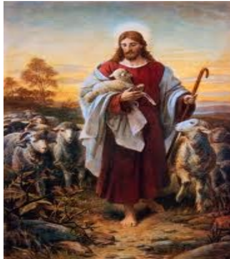
Good Shepherd Sunday

The Arundel & Brighton Diocesan Trust is a Registered Charity No 252878