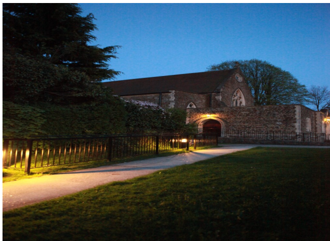
The Arundel & Brighton Diocesan Trust is a Registered Charity No 252878