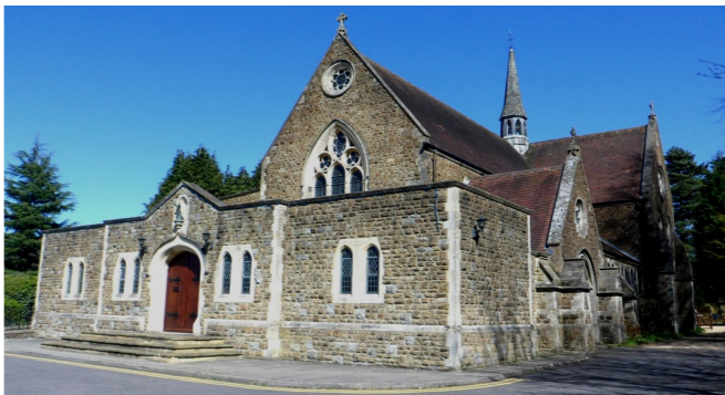
The Arundel & Brighton Diocesan Trust is a Registered Charity No 252878

1st September 2013 22nd Sunday In Ordinary Time Year 3